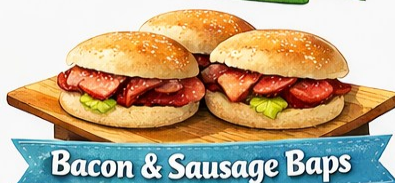
Bacon & Sausage Baps